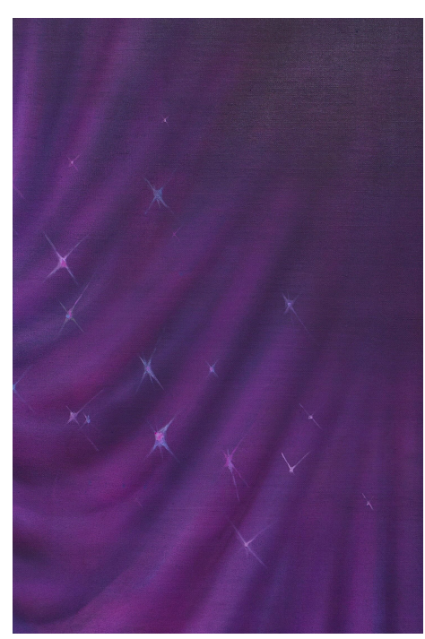
Olesia Lavrinenko, from The Imminent series, 2024 (detail)